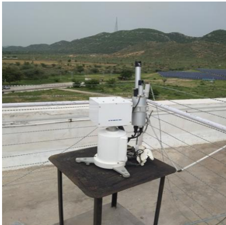
Sky Radiometer Aethalometer